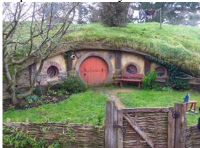
Hobbiton Movie Set

9:00a.m. Depart for a half day tour of the Hobbiton Movie Set.