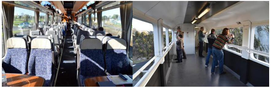
Tranz Alpine Train Seats