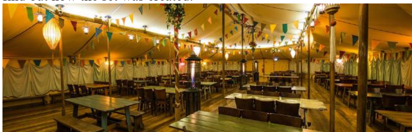
Marquee Lunch Place

Hobbiton is the only film site used in the Lord of the Rings trilogy. View the hobbit holes and find out how the set was created.